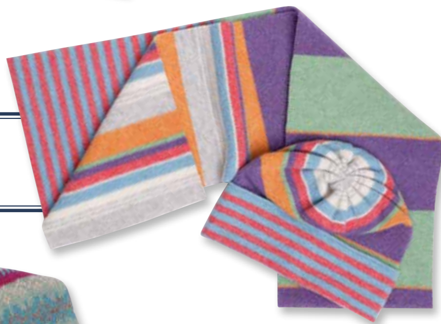
S572 Random Striped Felted Scarf SC572 Random Striped Hat