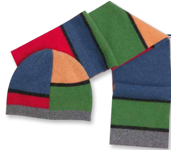
S533 Coloured Block Felted Hat H533 Coloured Block Hat