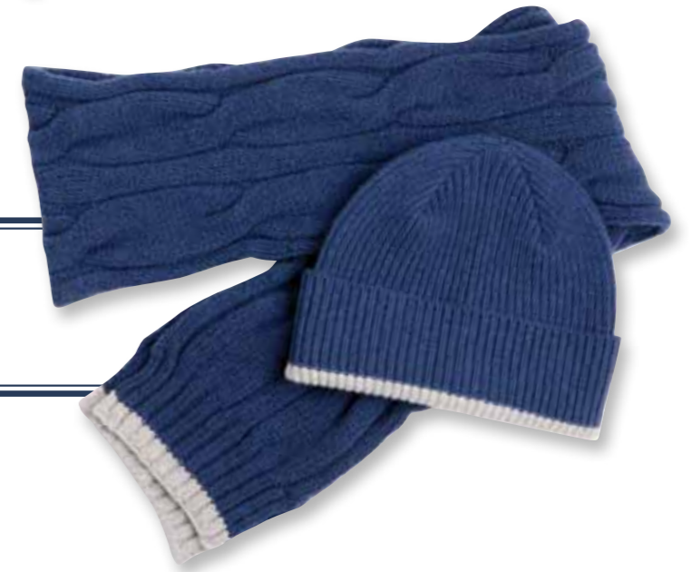
S568 Cable Scarf with Coloured Tip H568 Ribbed Hat with Turn Up and Colour Band