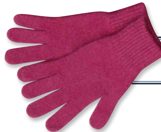
GL583 Plain Gloves Suits Styles 536, 579, 578