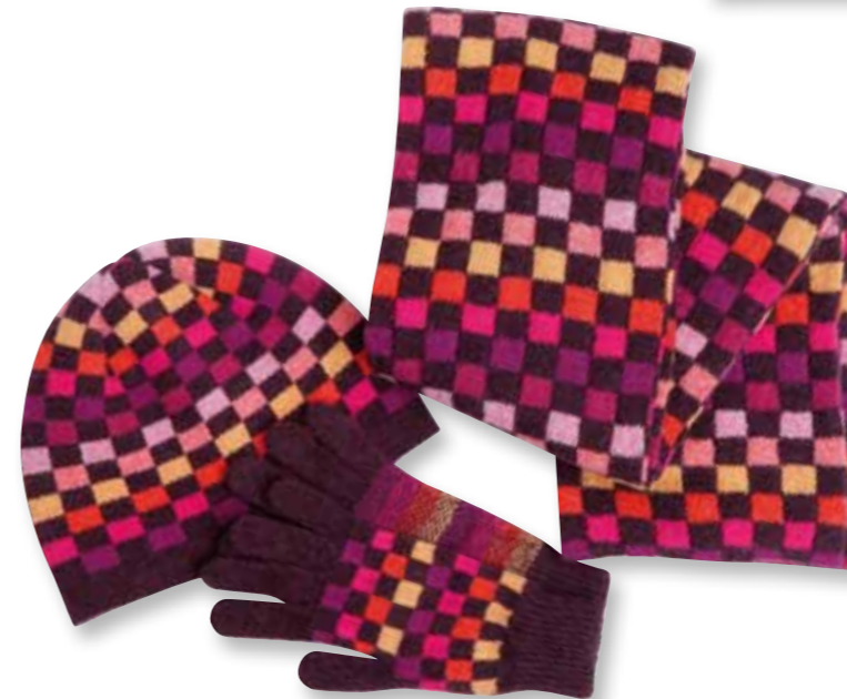
S542 Mosaic Tubular Scarf H542 Mosaic Hat GL542 Ladies Mosaic Gloves