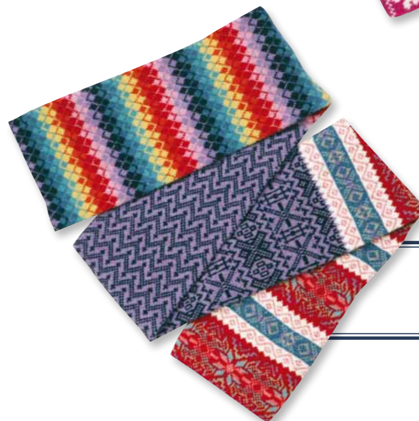
S577 Multi Fairisle Scarf