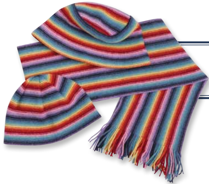
S140 Multi Striped Warp Scarf SK140 Multi Striped Warp Skull Cap PH140 Multi Striped Fisherman Warp Hat