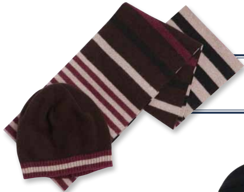
S566 Felted Striped Scarf H566 Felted Striped Hat