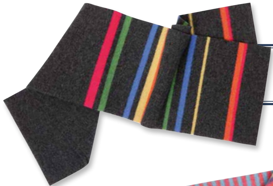
S571 Flash Striped Felted Scarf