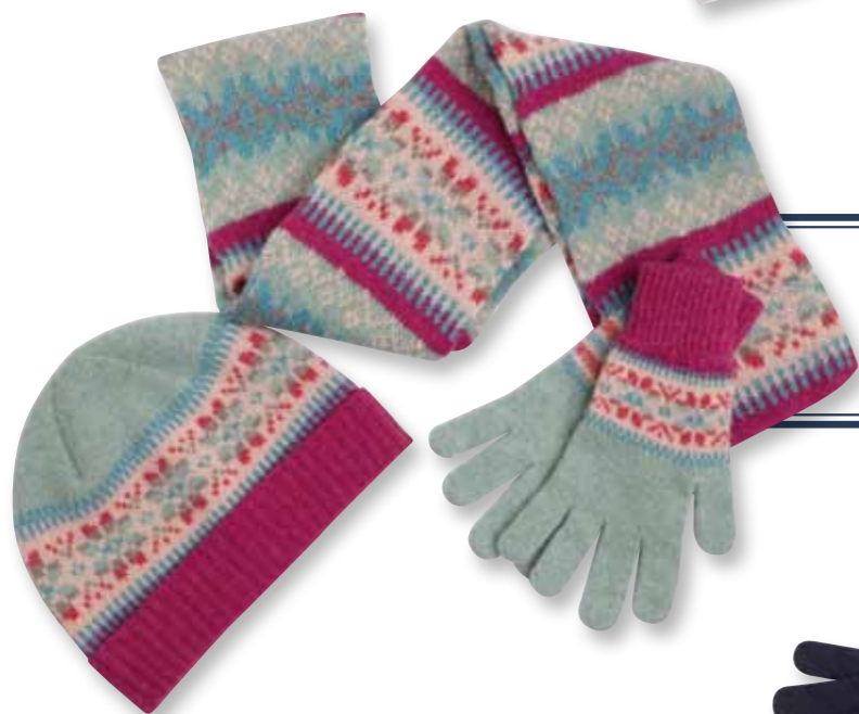
S573 Tubular Fairisle Scarf H573 Fairisle Hat GL573 Fairisle Gloves