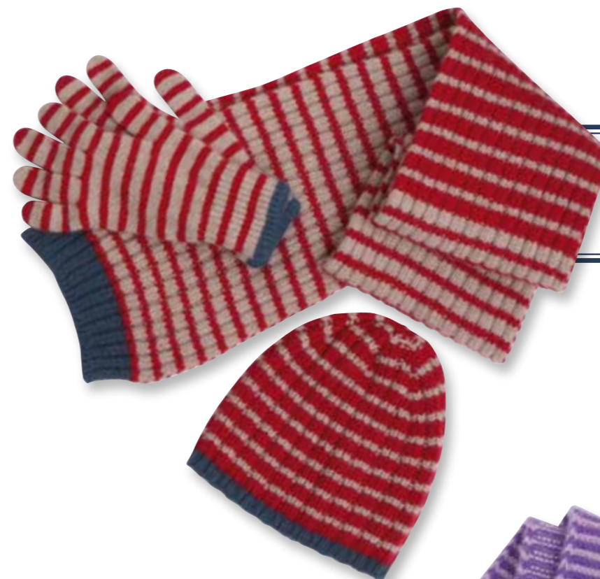
S578 Chunky Rib Scarf H578 Chunky Rib Hat GL578 Striped Gloves