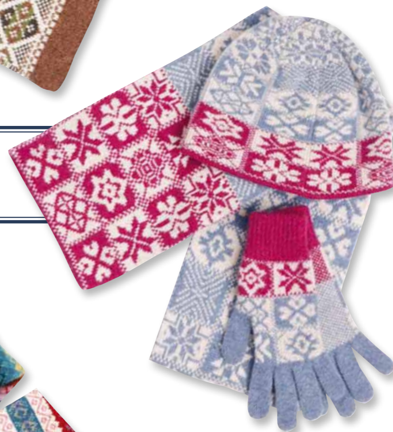
S576 Nordic Fairisle Scarf H576 Nordic Fairisle Hat GL576 Nordic Fairisle Gloves