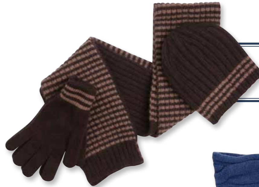
S569 Chunky Rib Scarf H569 Ribbed Hat GG569 Ribbed Gloves