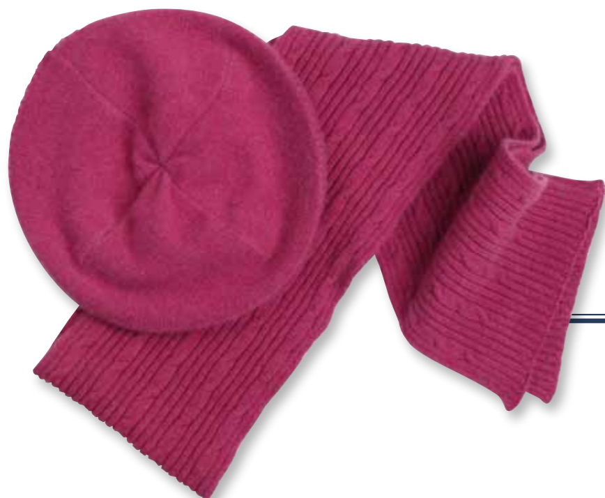
S536 Cable Scarf B536 Plain Beret