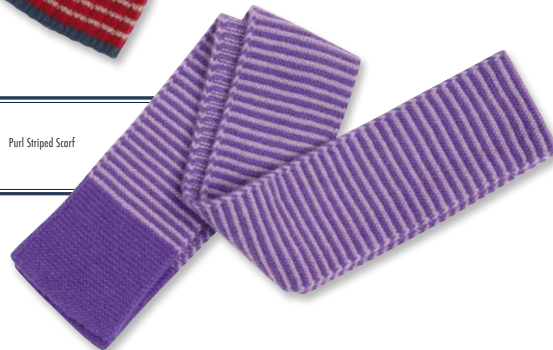
S579 Purl Striped Scarf