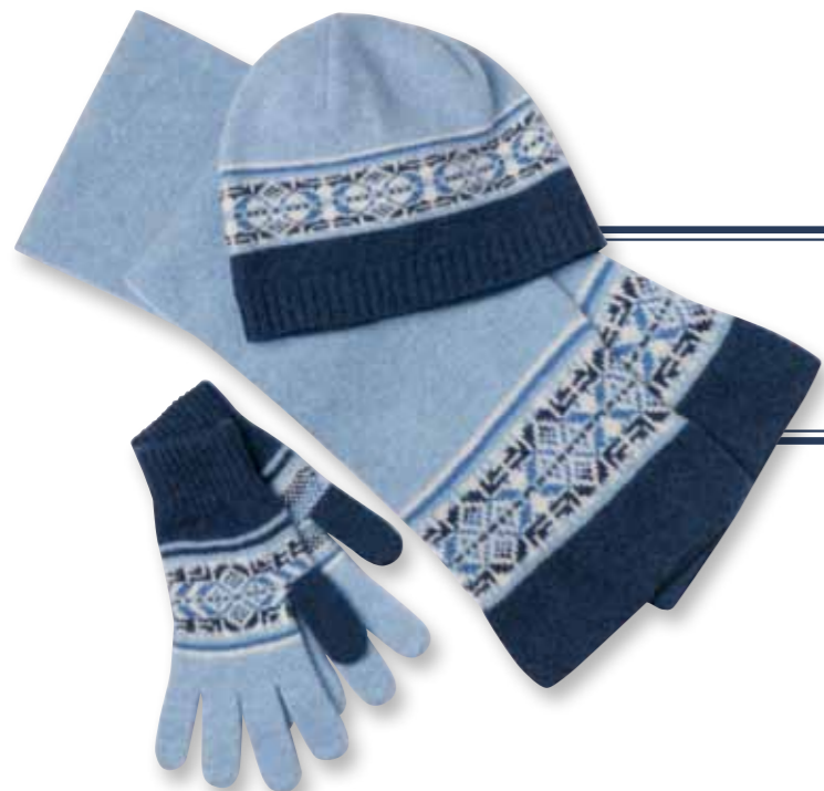
S582 Traditional Fairisle Scarf H582 Traditional Fairisle Hat GL582 Traditional Fairisle Gloves