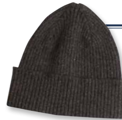
H439 Ribbed Bob Cap