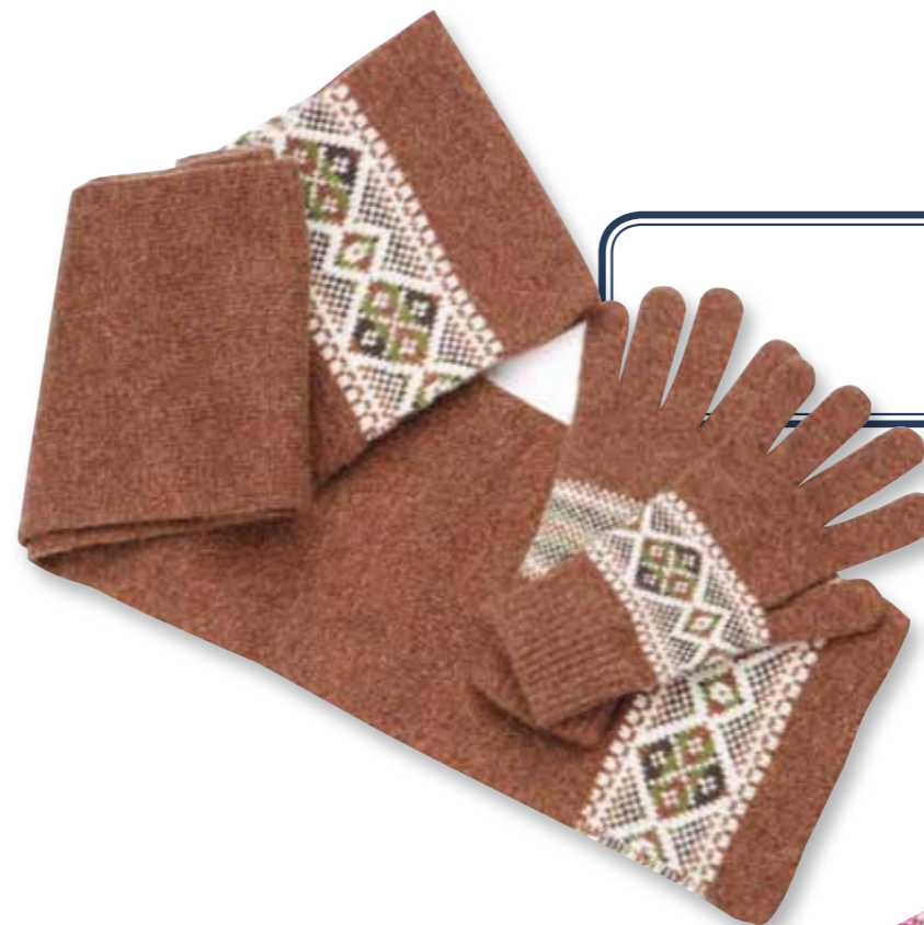
S575 Diamond Fairisle Scarf GL575 Diamond Fairisle Gloves