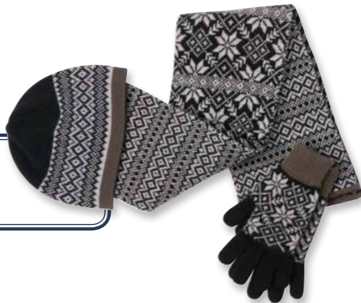
S567 Reversible Tubular Fairisle Scarf H567 Fairisle Hat with Tip Edge GG567 Gents Snowflake Pattern Gloves