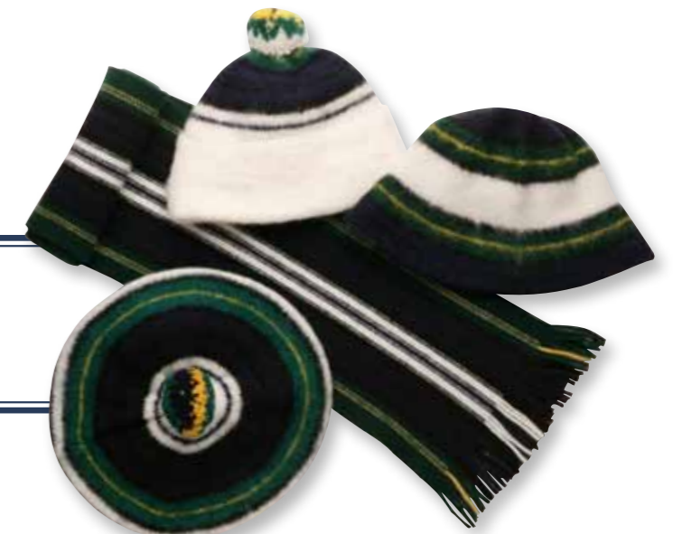
AT1A/C Adult/Child Tartan Tam SC1A Adult Ski Cap S140AT Tartan Scarf SC169AT/CT Adult/Child Tartan Cloche Hat