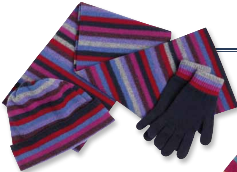
S325 Multi Coloured Felted Scarf SC325 Multi Coloured Felt Hat GL325 Ladies Plain Gloves With Striped Cuff