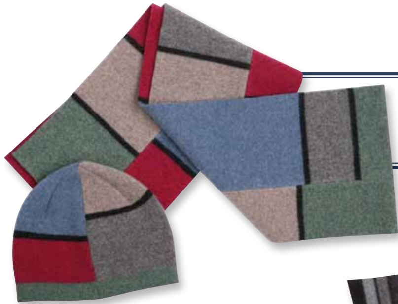
S523 Patchwork Colour Block Felted Scarf H523 Colour Block Hat