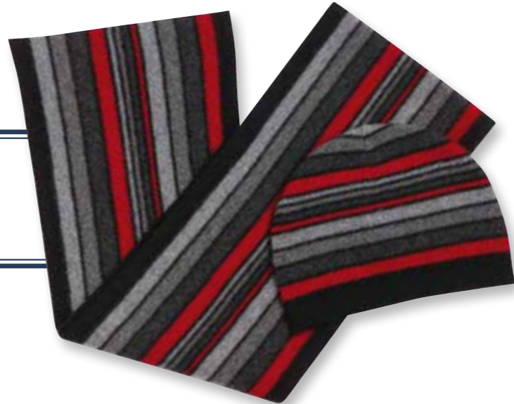
S530 Felted Scarf with Horizontal Stripes H530 Horizontal Striped Hat